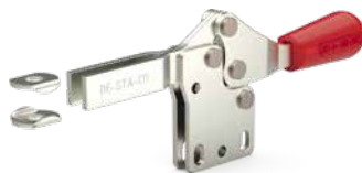
Straight Base Model 217-UB-L

See page MC-ACC-7 for Complete offering of Open bar accessories