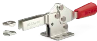
Flanged Base Model 217-U-L