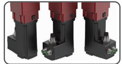
Motor connection positions can be rotated in 90° increments

Drive motors can be ordered in an inline (straight) or redirected configuration