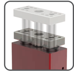
Adjustable Stroke Up-to-60mm