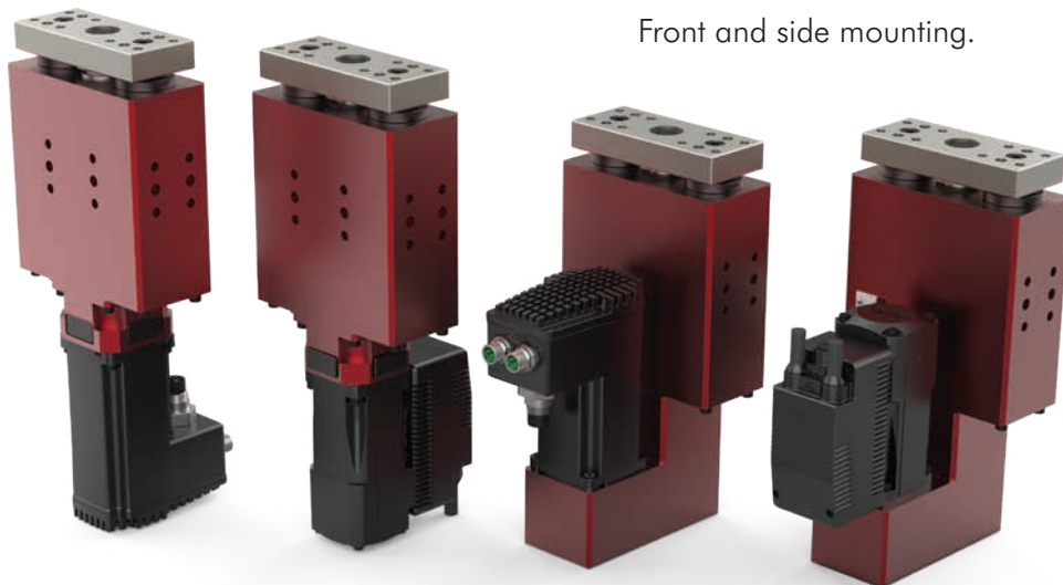
Front and side mounting.

DESTACO's 95W series guide/lifter features adjustable extend and retract stroke and speed control.